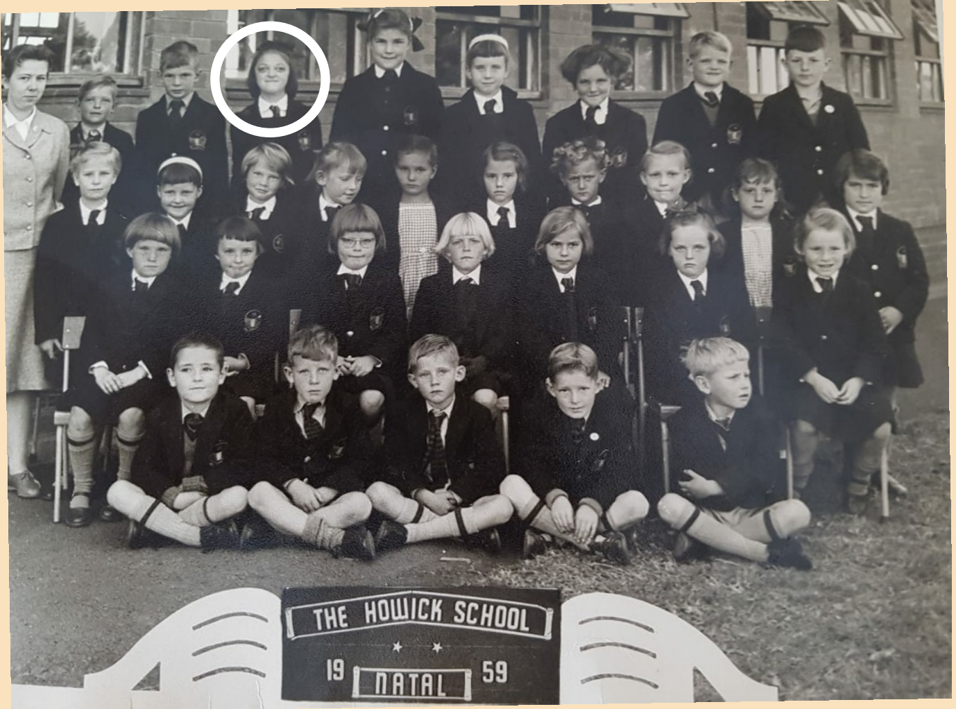
Grade one class in Howick school

A keyboard identical to the borrowed Keyboard that I used to play 'Behold your Bridegroom comes', 'I heard the voice of my Beloved' and 'Warrior bride'